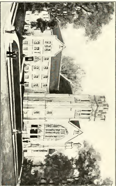
THE NEW PRESBYTERIAN CHURCH CORNER STONE LAID THANKSGIVING DAY, 1913. NOW IN COURSE OF ERECTION